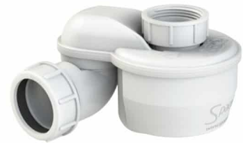
Compact Basin and Bath wastes

Available to suit basin 32mm and bath 40mm wastes Both with 40mm outlet